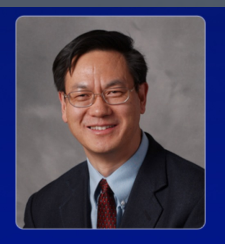
Zhong Lin Wang Foreign academician of Chinese Academy of Sciences, European Academy of Sciences National Academy of Inventors